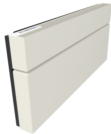
ClimaRad Care H1C